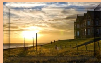
Explore Giant's Causeway!