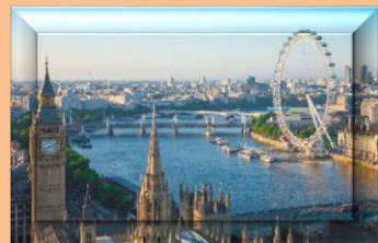
Get an Eye Full of London!