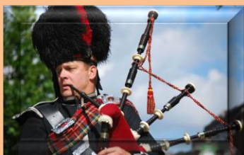
Visit the land of bagpipes and games!